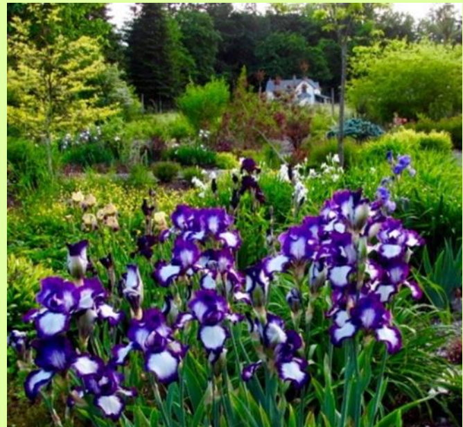
See the irises before the buttercup groundcover

Eventually, I eased off the couch, limped through the garden, returned to the deck, and propped my red and swollen leg onto the patio table near my husband. "So, has your garden missed you, Hon?" His too direct question elicited an immediate allergic response in my eyes, and my already wrinkled lips distorted further. "It's a disaster!" The site of my main spring project of creating order and health to my strawberry fields, where deep green plants and large white blossoms separated by fresh sawdust pathways should have been, was a deluge of knee-deep waves of yellow buttercups in blossom. The thistles in the asparagus bed and the raspberry rows were tall enough to prick my heart, and sudden death of shrubs and trees would require chainsaw pruning. George suggested I was tired and that it was probably time for my meds. True.