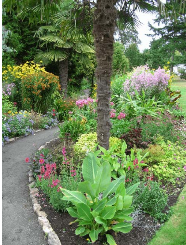
Perennial Border at Playfair Park

Parking is available on Cumberland Road, Rock Street or Judge Place. Visitors who have difficulties managing steep walkways can be dropped off at Judge Place and be picked up at Rock or Cumberland.