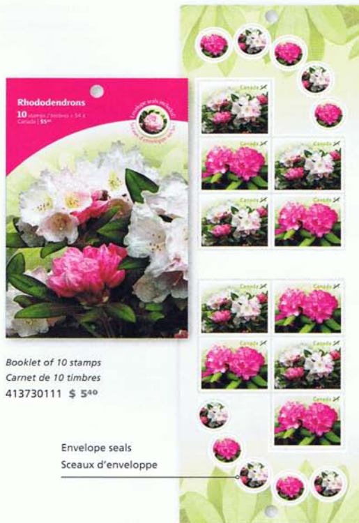
Booklet of 10 stamps Carnet de 10 timbres 413730111 $ 5 00

To learn more about Agriculture and Agri-Food Canada, visit: www.agr.gc.ca