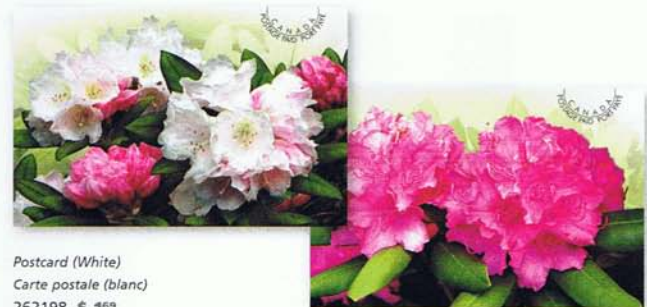
Postcard (White) Carte postale (blanc) 262198 $ 1 69

Domestic lettermail and overseas rates are subject to rate approval.