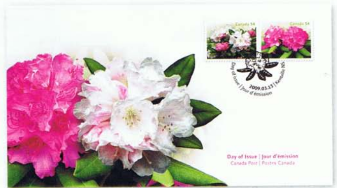
OFDC PPJO 413730131 $ 2 00