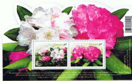
Souvenir sheet Bloc-feuillet 403730145 $ 1 00