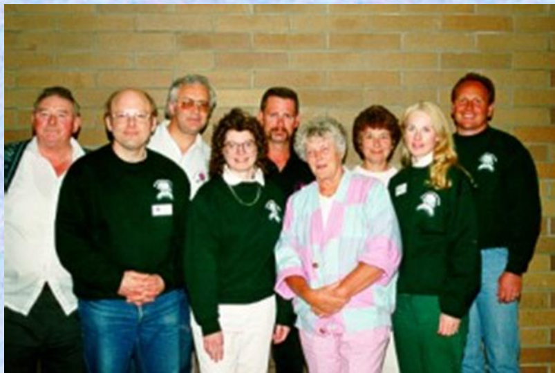
Nanaimo Rhododendron Society Executive 1992 - 1993