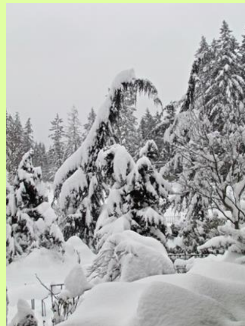
Winterlings arrived in the garden – monsters of every shape and size

Today, I saw the Salix that was still lying where it fell a few weeks ago. I examined and decided how I would vigorously prune it in an attempt to hoist it upright and encourage it to