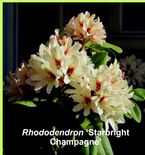
Rhododendron 'Starbright Champagne'