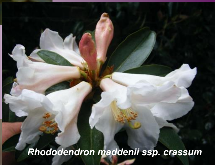
Rhododendron maddenii ssp. crassum