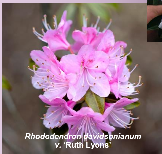
Rhododendron davidsonianum v. 'Ruth Lyons'