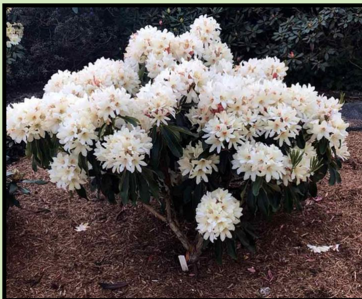
Rhododendron 'Sparkling Stars' [Yaku 'Sunrise' x 'Hansel'] x Lem's Cameo)